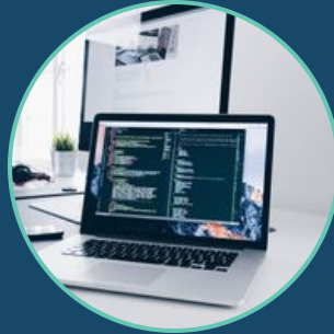
CUSTOMISED PROGRAM DEVELOPMENT