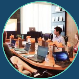
GROUND PREP PROGRAMS & VIRTUAL COACHING