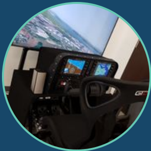
FLIGHT TRAINING DEVICES SUPPORT