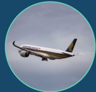
AIRLINE EMPLACEMENT PREP PROGRAM