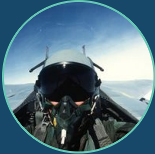
AIRLINE PILOT/INSTRUCTOR MENTORS