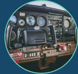
TRAINING DELIVERY PACKAGES