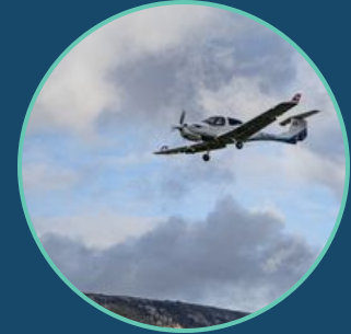
PARTNERED FLYING SCHOOLS